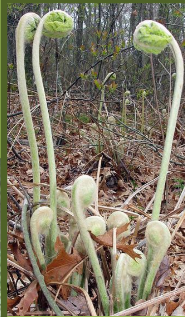
Cinnamon fern fiddleheads