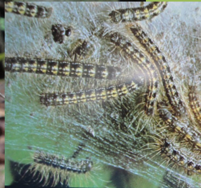
15 Tent Caterpillar, to 3", p. 767