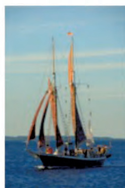
Family fun on the Ecology Sail.