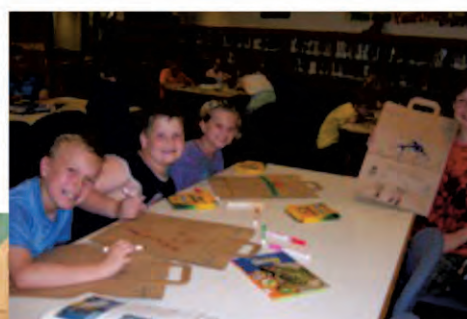
Look for Hardings bags promoting the event!