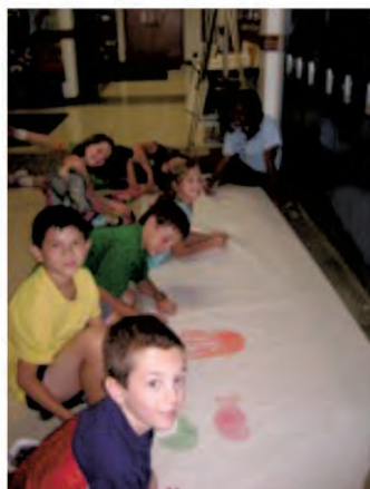
Summer students create banners for the event.

Families, students and staff are getting ready for the event and learning how to protect our planet.