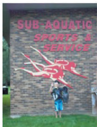
Scuba lessons open up a new world.