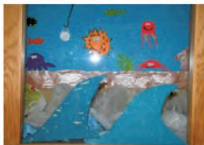
Recycled materials create art!