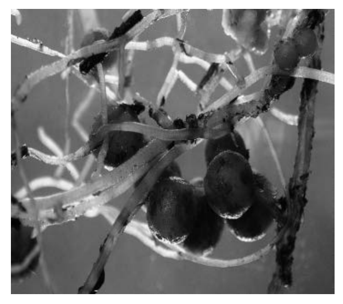
Figure 1. Nodules on legume roots. Rhizobia grow inside the nodules and convert atmospheric nitrogen ( N_2 ) to ammonium ( NH_4^+ ).

produced through photosynthesis. With the rhizobium–legume system, students can address and readily connect multiple big ideas with their questions and investigations while developing their science practice skills.