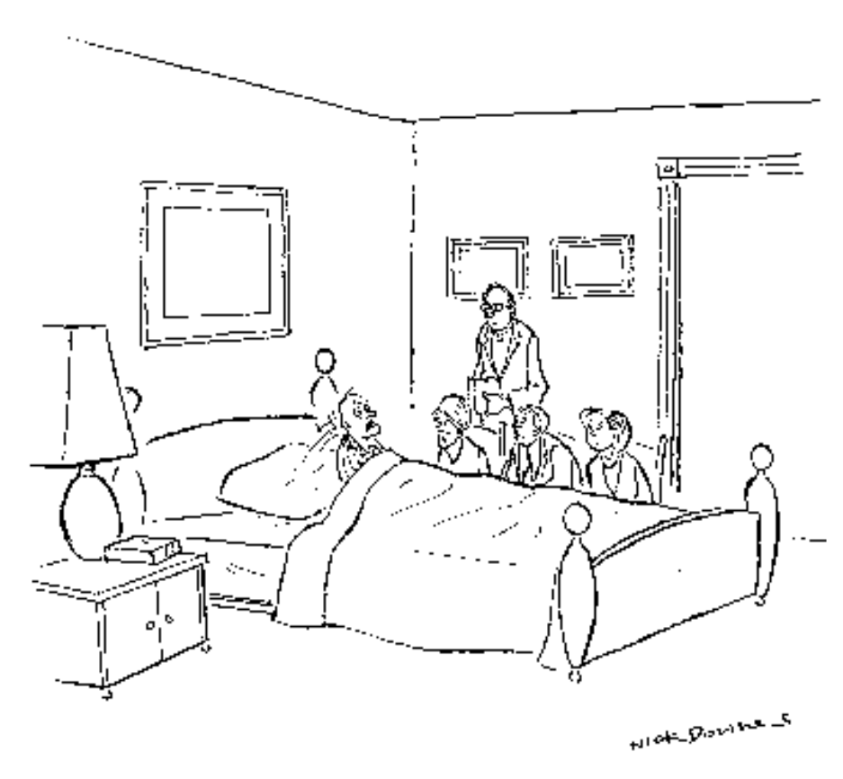
"I've forgotten what I want to be remembered for."

basic of human rituals—the conversation with a stranger—turns out to be a minefield.